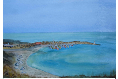
Agios Georgios Harbour / watercolour