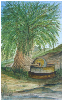
Olive Tree and Press / watercolour