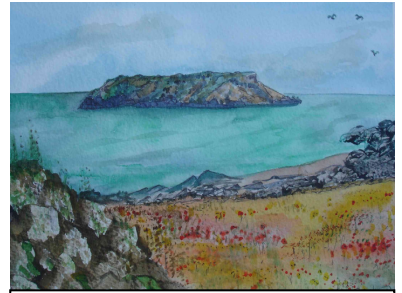
Agios Georgios Poppies watercolour