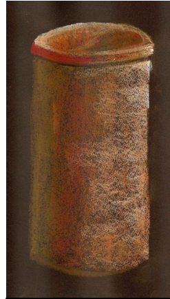
Pastel Pot /soft pastel