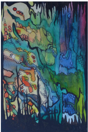
UnderTheSea 1 / watercolour