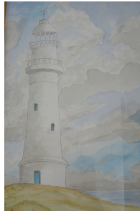
Paphos Lighthouse / watercolour