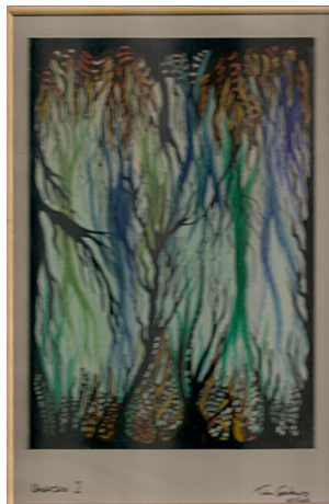
UnderTheSea 2 / watercolour