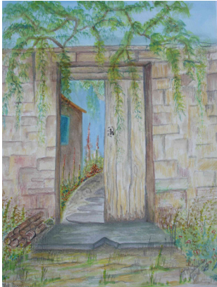
Old Wooden Door / watercolour