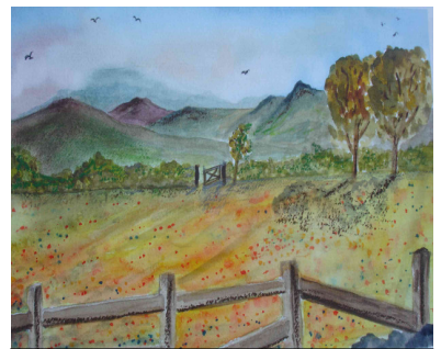
Open Gate / watercolour