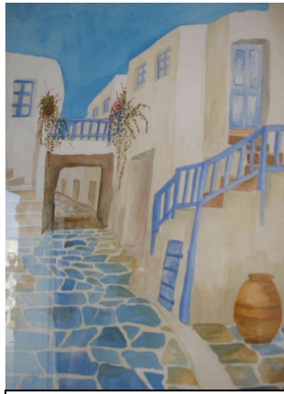
Greek Street / watercolour